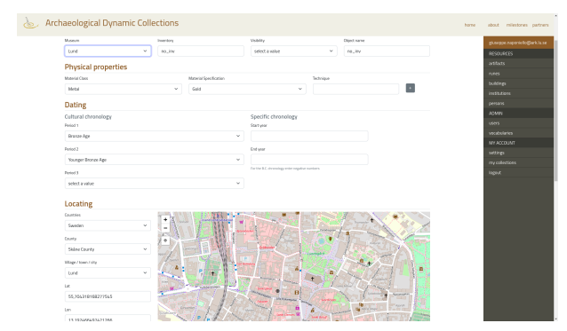
Fig 4. To support the new semantic-mapped metadata, the authoring tool make use of ontologies and vocabularies