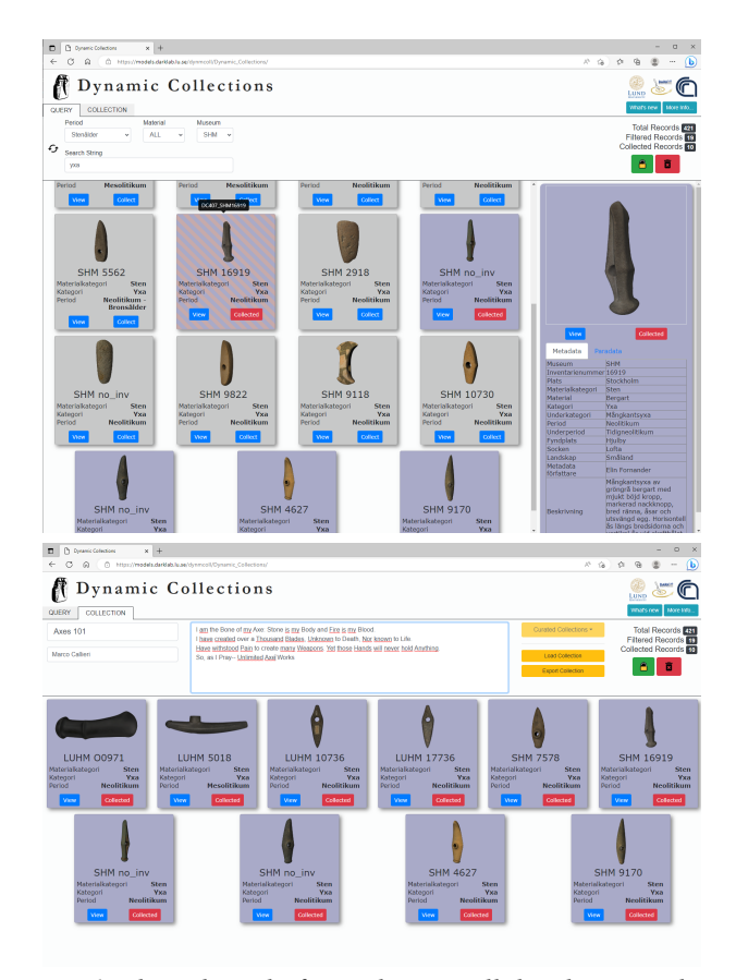
Fig 1. The online platform, showing all the objects in the archive, with details and metadata (top) and an annotated collection (bottom)

The entire archive of objects can be explored with a standard web interface and simple searching/filtering functionalities.